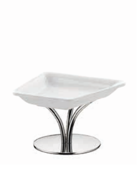
Buffet stand ,S' can be combined with SEQUENCE Porcelain dish S 35