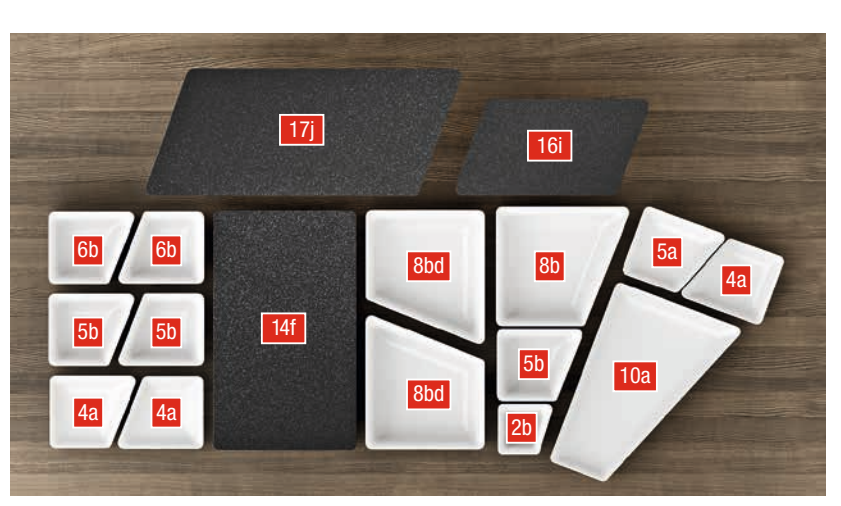
Product overview on page 12-14

The ice tray is available in various sizes – cooled using crushed ice or cooling batteries.