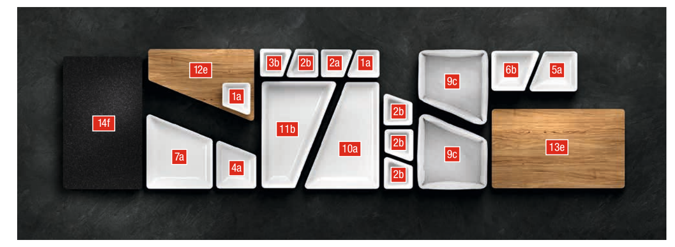
Product overview on page 12-14