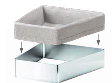
Breadbasket with fabric insert available in sizes L, M, S can be hung in the respective 70 or 100 mm frames.

In temptation's way ... A buffet presented with SEQUENCE catches the eye and stimulates the palate. The striking shapes of the intelligent buffet concept and the multitude of ways in which the pieces can be arranged set entirely new benchmarks in food presentation. The innovative combination of trapezoid modules will channel a great sense of energy through your dining and reception rooms. As you would expect, all the individual items in the range are coordinated, which gives your staff great creative freedom when designing and combining table settings. The SEQUENCE collection will make your buffets and dinners an unforgettable experience!