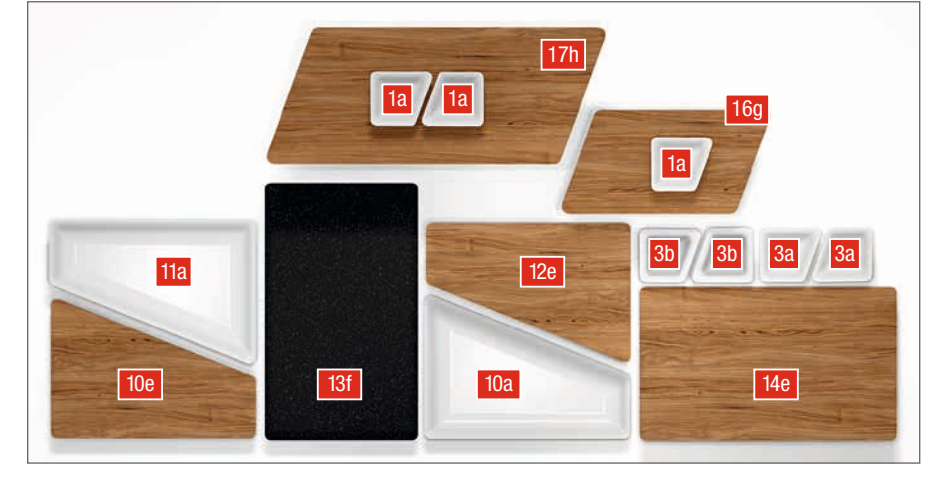
Product overview on page 12-14

Wooden or Corian platforms available in two sizes to show off your culinary delights.