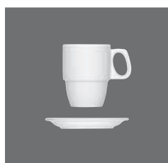
Becher stapelbar, Mug stackable and saucer, Gobelet empilable et soucoupe, Taza mug apilable y platito, Mug impilabile e piattino