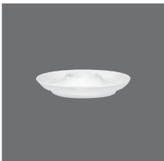
Eierbecher , Egg cup, Coquetier, Copa de huevo, Portauovo