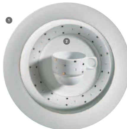
1 413430 La Perla Uni 2 413440 La Perla