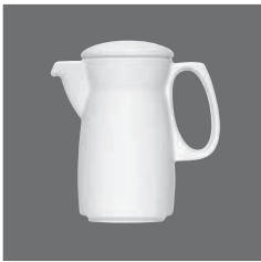
Kaffeekanne , Coffeepot, Cafetière, Cafetera, Caffettiera