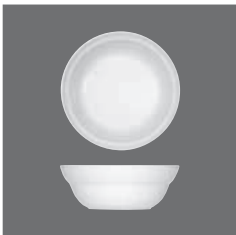
Bowl , Bowl, Bol, Bowl, Bowl

> Platte oval Fahne 29 90 2029 - 289x187 (11.38x7.36) 21/130 550 > Platte oval Fahne 32 90 2032 - 319x207 (12.56x8.15) 23/143 720 > Platte oval Fahne 36 90 2036 - 356x237 (14.02x9.33) 25/147 950