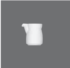
Milchgießer ohne Henkel , Creamer without handle, Pot à lait sans anse, Lechera sin asa, Lattiera senza manico