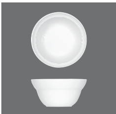
Bowl , Bowl, Bol, Bowl, Bowl

> Salatiere rund 15 90 3165 0,22 (7.44) 150 (5.91) 43/130 250 > Salatiere rund 18 90 3168 0,45 (15.21) 181 (7.13) 59/159 430