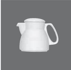
Teekanne , Teapot, Théière, Tetera, Teiera