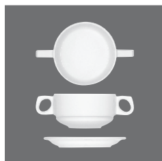
Suppentasse stapelbar, Cream soup cup stackable and saucer, Tasse à consommé empilable et soucoupe, Taza consomé apilable y platito, Tazza brodo impilabile e piattino