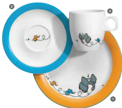
1 424550 Slon 2 424550 3 424550