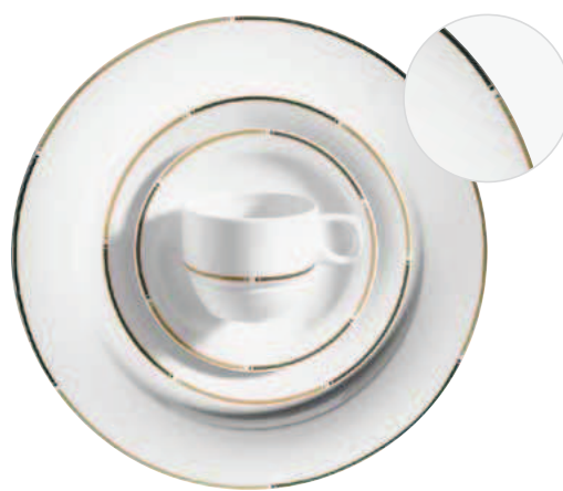
413420 Amano Grau 424450 Amano Grün 424460 Amano Gelb-Orange