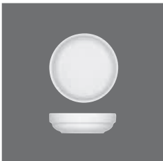
Schale , Sugar/butter dish, Coupelle, Platito, Coppetta