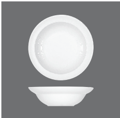
Salatiere rund , Salad dish round, Saladier rond, Ensaladera redonda, Insalatiera rotonda

> Eintopfschale 0.85 90 6090 0,85 (28.74) 202 (7.95) 73/218 670