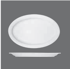
Platte oval Fahne , Platter oval with rim, Plat ovale avec aile, Fuente oval con ala, Piatto ovale

> Teller tief Fahne 23 90 0123 0,36 (12.17) 232 (9.13) 35/134 530