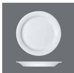
Teller flach Fahne, Plate flat with rim, Assiette plate avec aile, Plato llano con ala, Piatto piano con falda