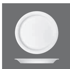
Teller flach schmale Fahne, Plate flat with narrow rim, Assiette plate avec aile étroite, Plato llano con ala estrecha, Piatto piano con falda stretta