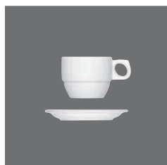
Tasse stapelbar, Cup stackable and saucer, Tasse empilable et soucoupe, Taza apilable y platito, Tazza impilabile e piattino