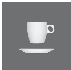
Tasse, Cup and saucer, Tasse et soucoupe, Taza y platito, Tazza e piattino