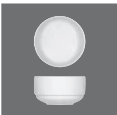
Bowl , Bowl, Bol, Bowl, Bowl

> Suppenschale 0.44 90 2940 0,44 (14.88) 147 (5.79) 71/217 340