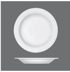
Teller halbtief Fahne , Plate half-deep with rim, Assiette demi-creuse avec aile, Plato medio hondo con ala, Piatto semifondo con falda

> Teller halbtief Fahne 20 90 0220 0,21 (7.10) 200 (7.87) 27/120 370