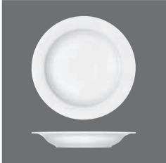
Teller tief Fahne , Plate deep with rim, Assiette creuse avec aile, Plato hondo con ala, Piatto fondo con falda

> Teller halbtief Fahne 20 90 0220 0,21 (7.10) 200 (7.87) 27/120 370