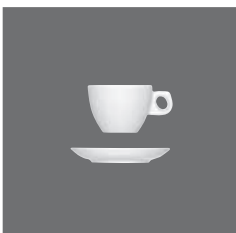
Tasse , Cup and saucer, Tasse et soucoupe, Taza y platito, Tazza e piattino