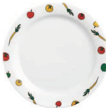
425002 Happy Veggies