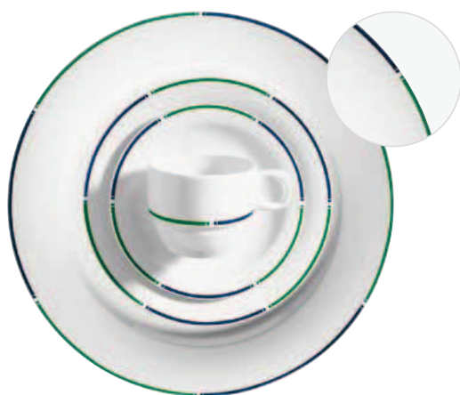
413410 Amano Blau 424430 Amano Blau II 424440 Amano Rot