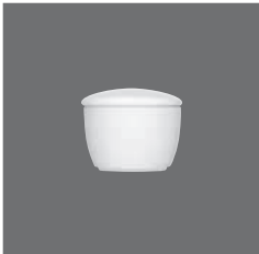
Zuckerdose , Sugar bowl, Sucrier, Azucarero, Zuccheriera