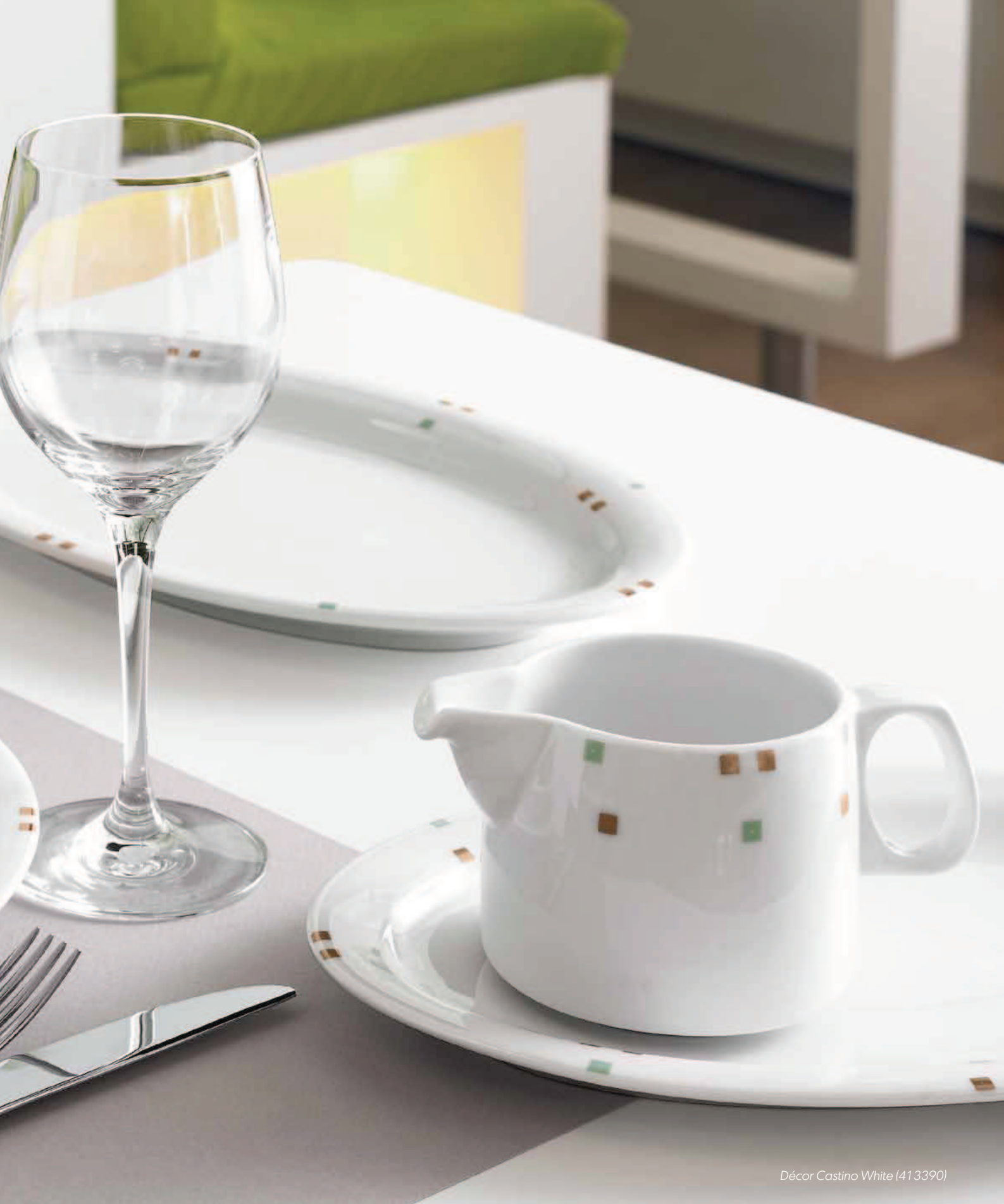
Décor Castino White (41 3390)

Opt for our decorating service to create even more atmosphere with the Dimension range. We will develop a customized pattern according to your requirements, suited to the preferences of your clientele and the interior design of your establishment.