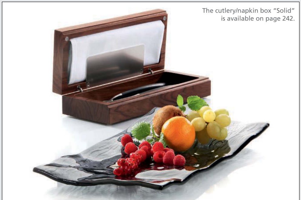
The cutlery/napkin box "Solid" is available on page 242.