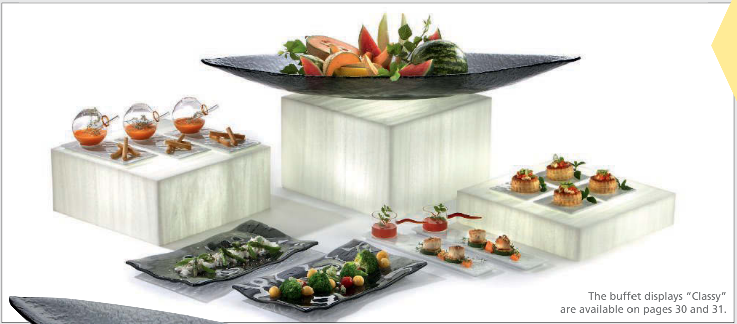
The buffet displays "Classy" are available on pages 30 and 31.