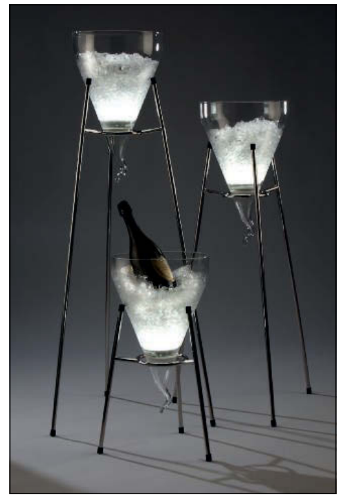
Buffet bowls in many variations and materials are available on pages 66 to 93.

"Stablo" XL ring item 8016.01 only one set extensions is required.