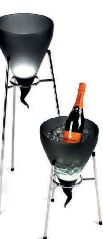
By positioning the cooler at an angle it is also suitable for buffet stands "Stablo" M and L.